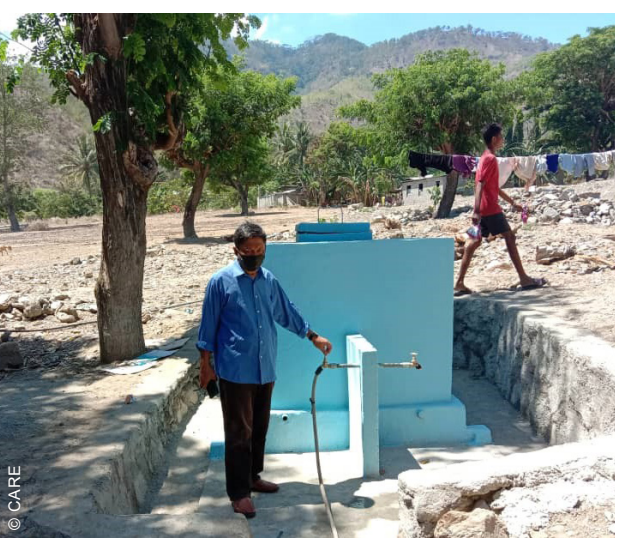
Rehabilitation of water tanks was one of the community infrastructure activities implemented.

One of the major challenges of the response was implementing the project within the COVID-19 context. This delayed some activities, as COVID-19 mitigation policies were put into place that slowed cooperation between global-level technical teams and country-level field teams, prohibiting travel and limiting all external support to be carried out remotely. Another major challenge was the government decree early in the emergency that shelter material distributions had to meet a minimum of USD 600 per person and adhere to a government-approved material list. Taking the size of the project into consideration,