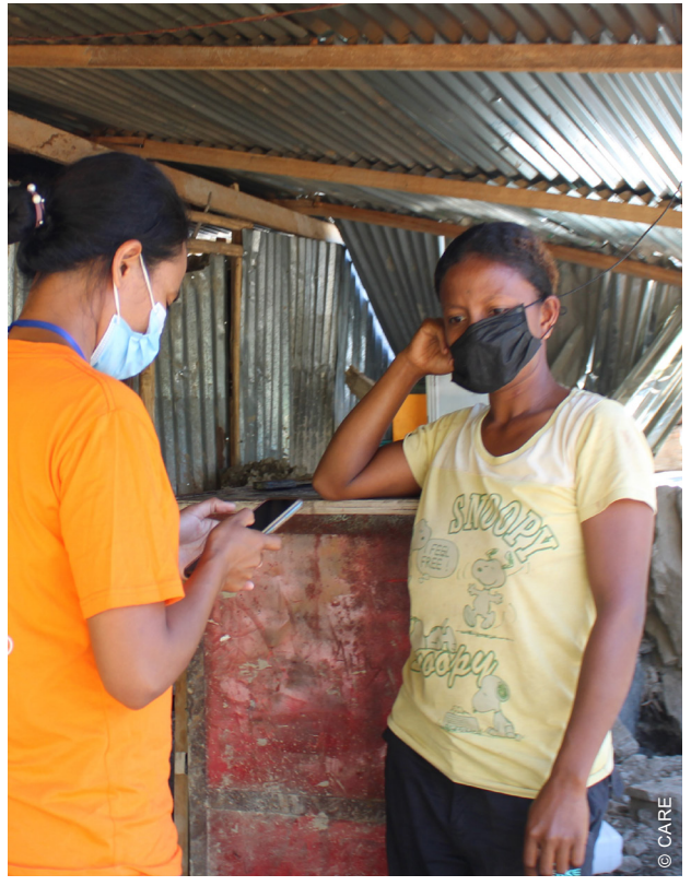
Assessments of the damaged households was a qualitative approach through KIIs and FGDs by engaging groups of women, men, girls, boys, elderly and Persons with Disabilities., June 2021.

One of the key learnings from the gendered shelter assessment was that, for participatory assessments to be meaningful, they must tie into and directly influence activity planning. The themes and ideas brought up during the participatory assessment remained strong influences for the programs that followed them.