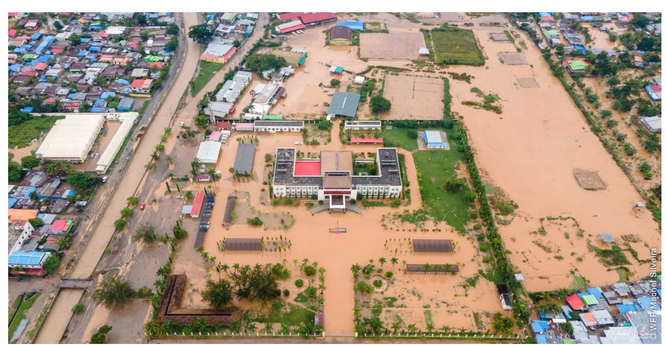
Torrential rains caused the worst flooding in recent years in Timor-Leste, April 2021.

Later in the crisis, the government issued a decree declaring its intent to coordinate a national cash program with UN agencies, requesting NGO support in complementing the program with government prescribed material distributions. This created constraints to INGO shelter programming that sought to address needs beyond emergency distributions.