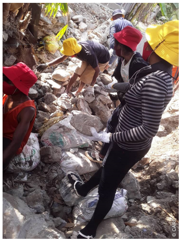
Women from the community enagaged in debris cleaning process.