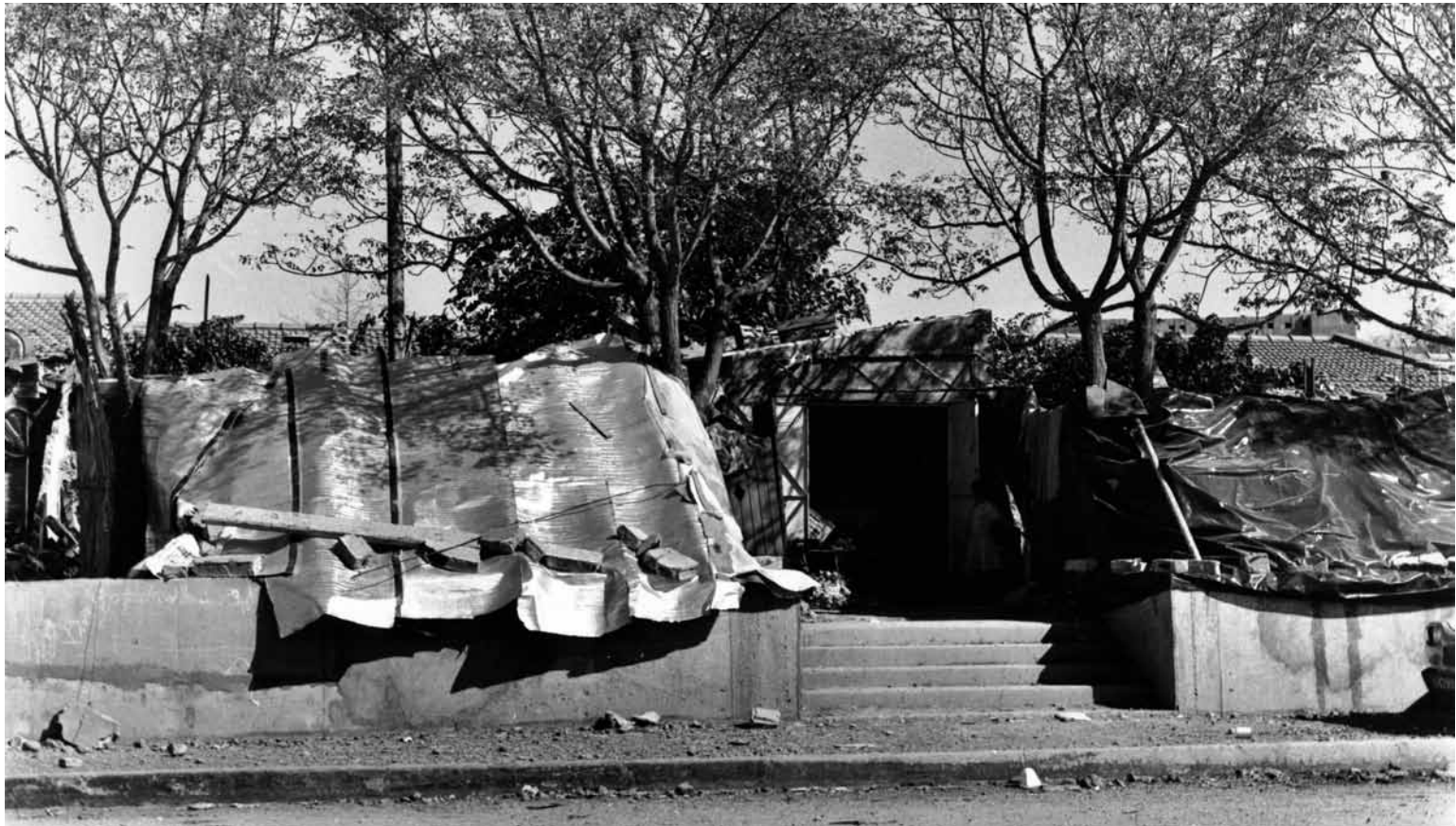
Top: a tent camp. Below: self built shelters in El Asnam. Tents and shelter material were distributed, and people were asked to live in camp sites for one year whilst prefabricated houses were built.