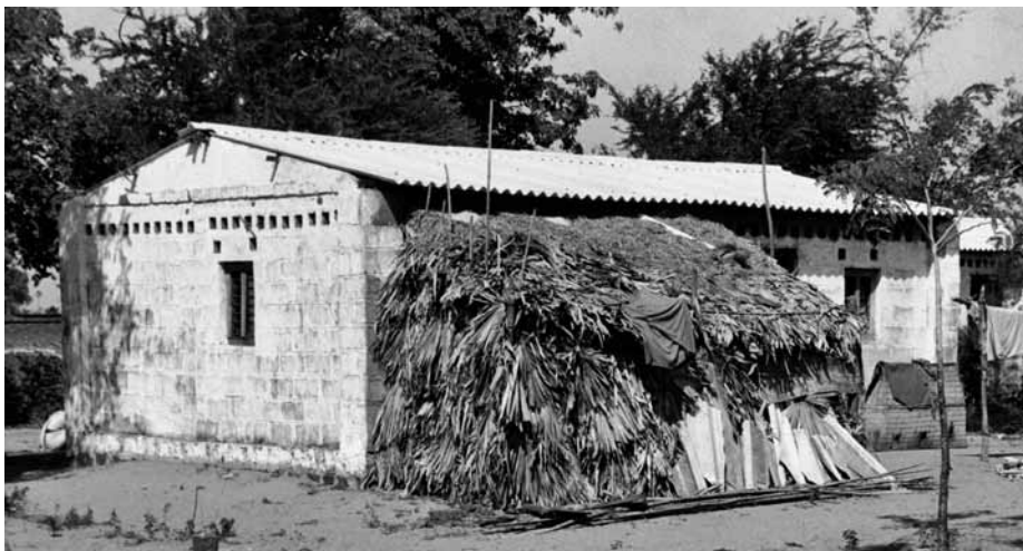
Housing by a reconstruction organisation built in 1969 following the cyclone, with lean to in the foreground. In the village many of the families evacuated most of the concrete block housing to live in improvised thatch lean-tos which are climatically more suitable.