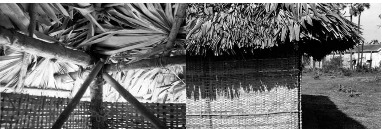
Details of a model home built out of bamboo and thatch to explain a safer techniques in cyclone resistant housing. It had key elements of: a well-anchored central post, triangulation to stiffen the frame, good connections of roof to wall using metal connections