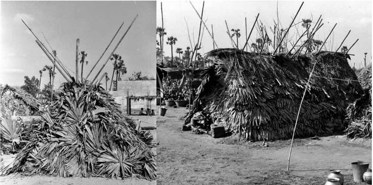
The government made stocks of thatch and bamboo available so that families to improvise shelters. Non-governmental organisations also built many thousands of these shelters.