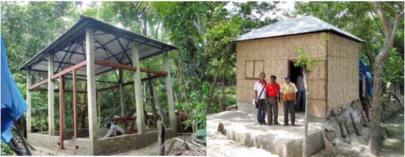
The core shelters were built by contractors and selection of families was through a lengthy transparent process Left shows the frame of the structure