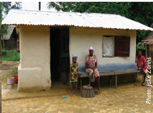
Completed houses for returnees