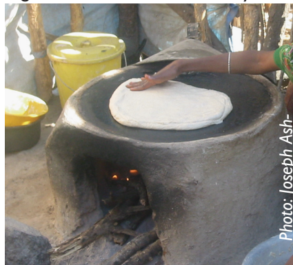
Firewood collection led to serious conflict with the host community. Because traditional stoves were not very efficient, an improved stoves project was set up.

In 2002, the organisation began the distribution of fuel-efficient stoves and kerosene stoves, significantly decreasing the demand for fuel wood by IDPs.