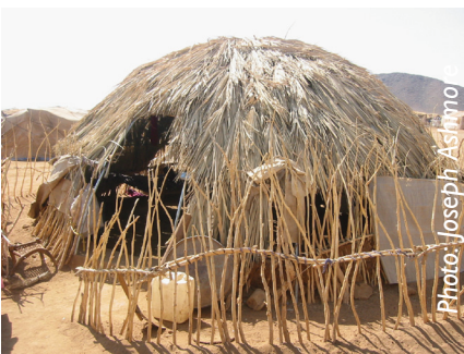
Palm leaves were distributed to 1,000 families.

With IDPs living in camps for much longer than expected, additional pressure was placed on natural resources in the area. IDPs and the host community were soon competing for scarce firewood and large areas of land near the camps were deforested.