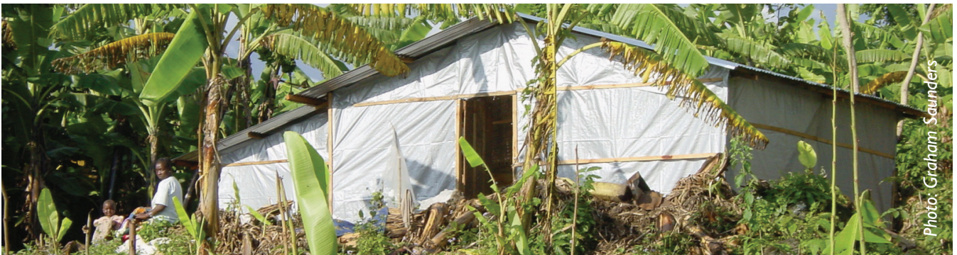
Sample of a temporary house